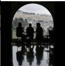
Feb. 10, 2007