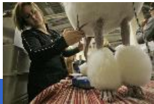
Feb. 12, 2007