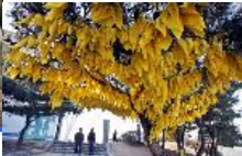
Feb. 11, 2007